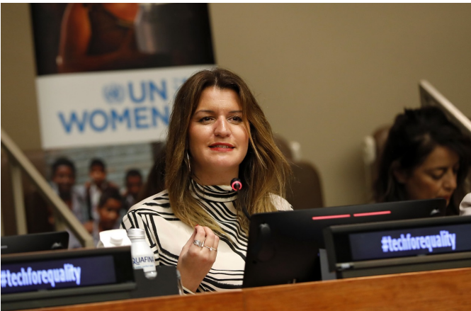
Marlene Schiappa, Secretary of State from the Government of France in charge of the Social and Solidarity Economy and Associative Life (France)

Throughout the event, panelists engaged in thoughtful discussions on a variety of topics, including the principles of a feminist digital future, the importance of multi-stakeholder partnerships, and the role of technology and innovation in promoting gender equality and empowering women and girls.