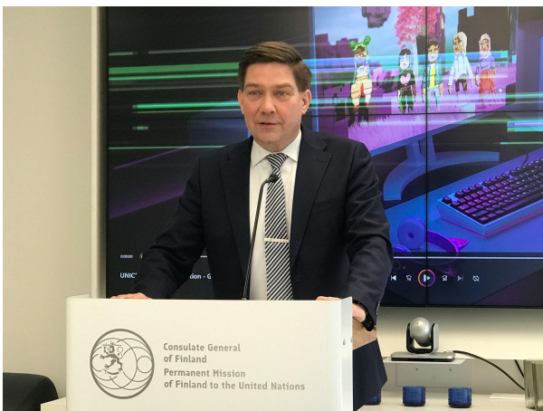
Minister of Equality Affairs Thomas Blomqvist reminded the Action Coalition that currently, Generation Equality is the world's biggest process to promote gender equality