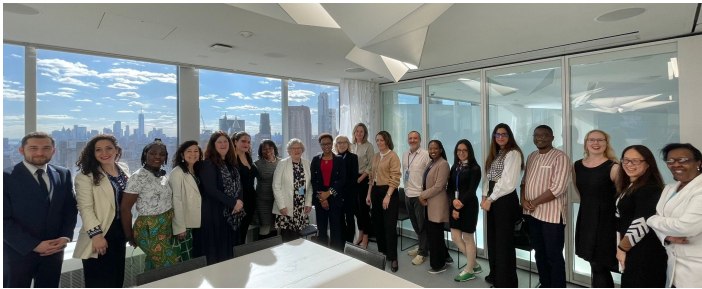
Leaders of the Action Coalition meet in person for the first time at the Permanent Representation of Finland to the UN