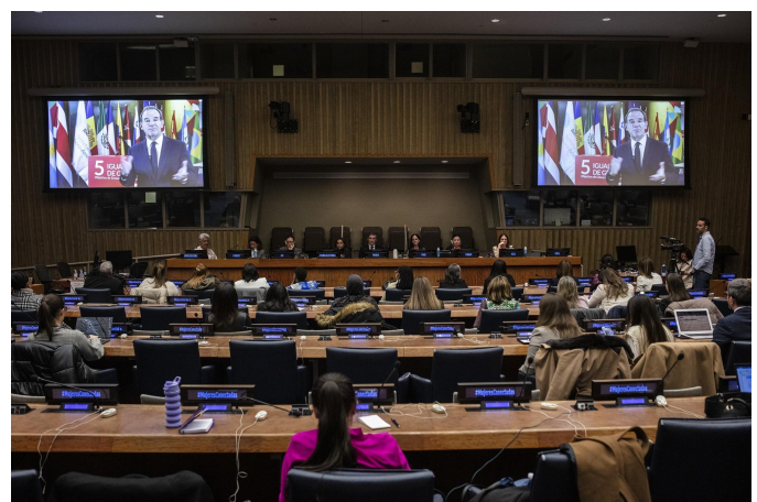
BBVA hosts Connecting Women in Latin America: The Roadmap Ahead at CSW67

BBVA Microfinance Foundation organized the session ' Connecting Women in Latin America: The Roadmap Ahead ' along with the OECD and the Dominican Republic at the United Nations headquarters in New York during CSW67. Watch the full session on UN Web TV, read the press release (EN) / press release (Spanish) , or check out the news video in Spanish.