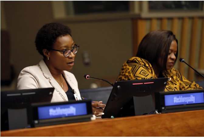
Ms. Jeanette Bayisenge, Minister of Gender and Family Promotion of the Government of Rwanda.

Throughout the event, panelists engaged in thoughtful discussions on a variety of topics, including the principles of a feminist digital future, the importance of multi-stakeholder partnerships, and the role of technology and innovation in promoting gender equality and empowering women and girls.